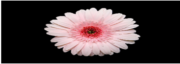
Thinking of You

Please call our office (610) 828-1250 or the Pastor's cell phone (267) 438-4234 if you or a loved one is in the hospital in order to get a visit. The Pastor fully understands your privacy and does not want to simply "show up" uninvited. If it's someone special to you that you'd like the Pastor to visit, please make arrangements for you and the Pastor to go together